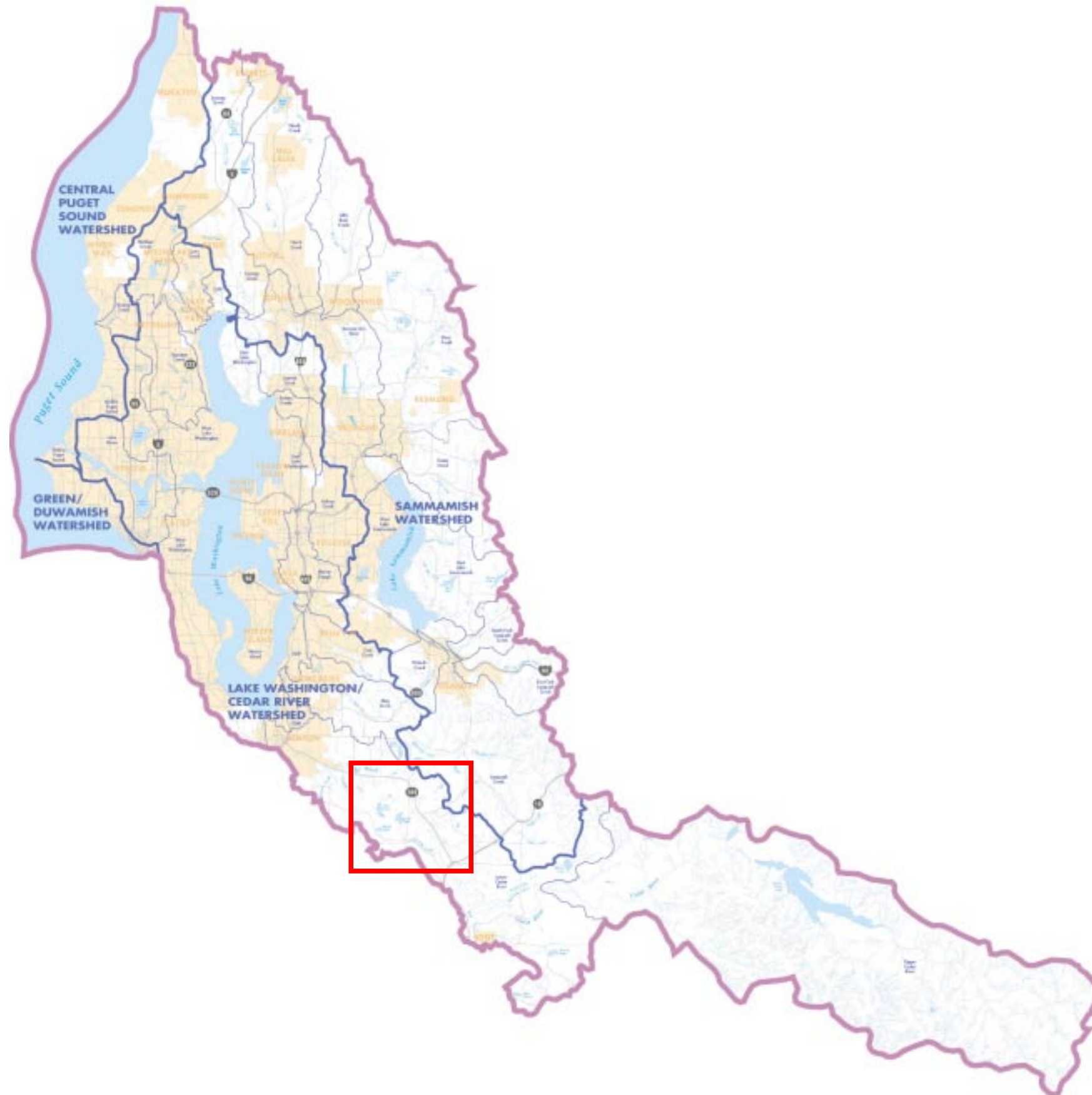
Figure 1 Cedar / Sammamish Watershed WRIA 08