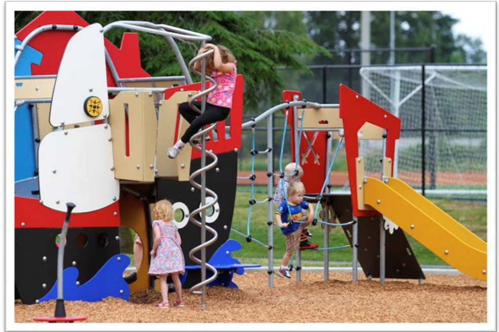
Play area at Marymoor Park