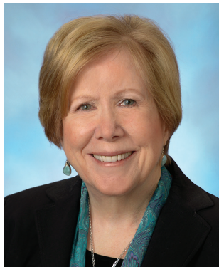
Jeanne Kohl-Welles King County Councilmember, District Four