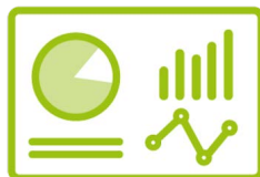
Long Term Care Facility