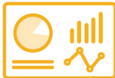
Key Indicators of COVID-19 activity