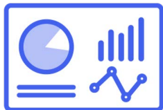
Daily Summary Dashboard