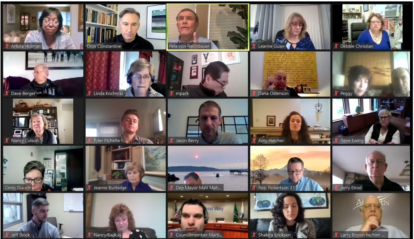
With South King County community leaders