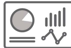
COVID-19 Outbreaks Tables