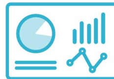
Case investigation and contact tracing