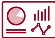
COVID vaccination among King County residents