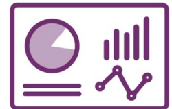
Economic, Social and Overall Health Impacts