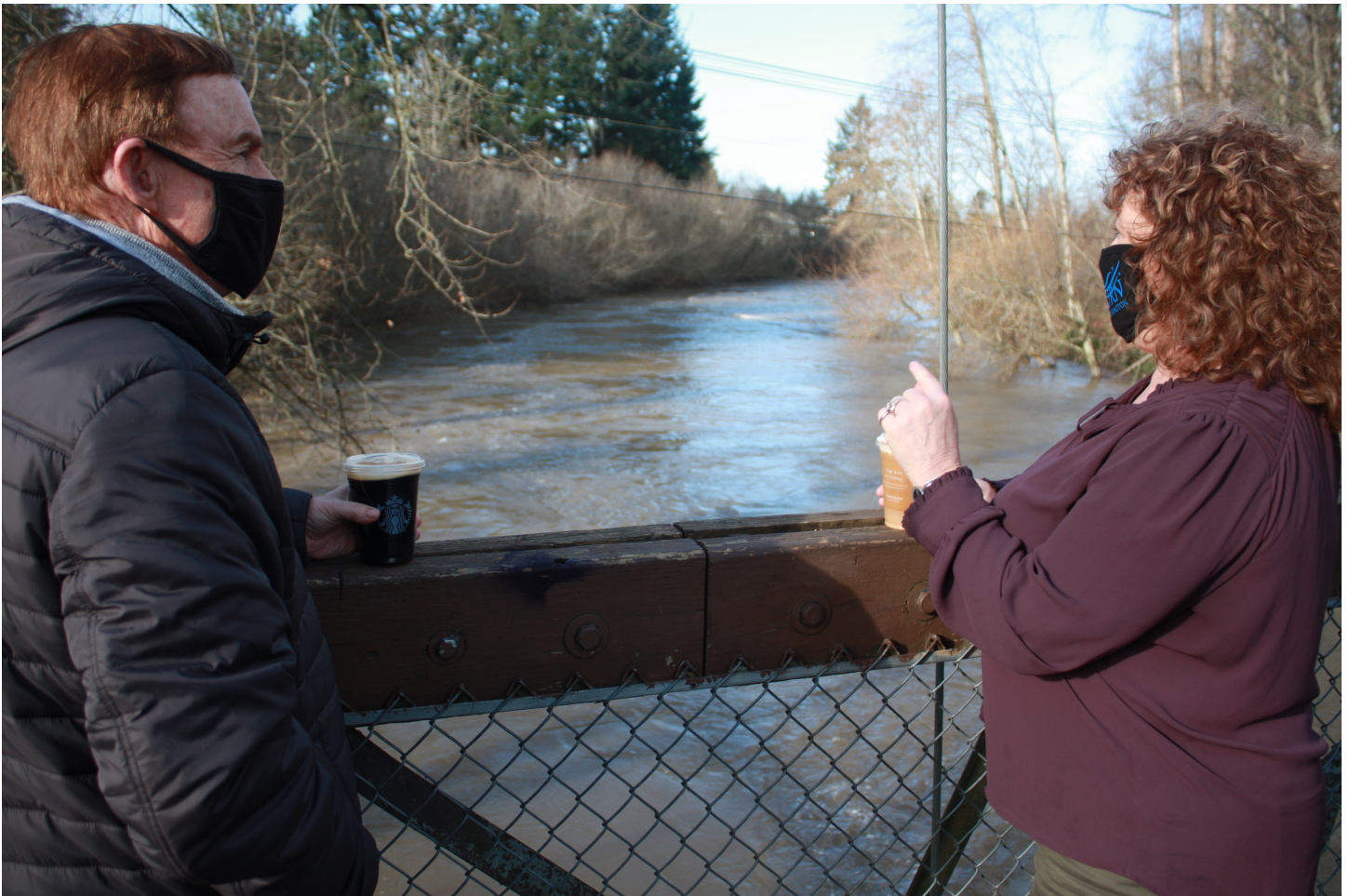
With Auburn Mayor Nancy Backus

With the King County Courthouse and Auburn City Hall restricted, it was great to get outside during a sun break and share ideas of county/city cooperation with Auburn Mayor Nancy Backus on the suspension bridge between Isaac Evans and Dykstra Parks.