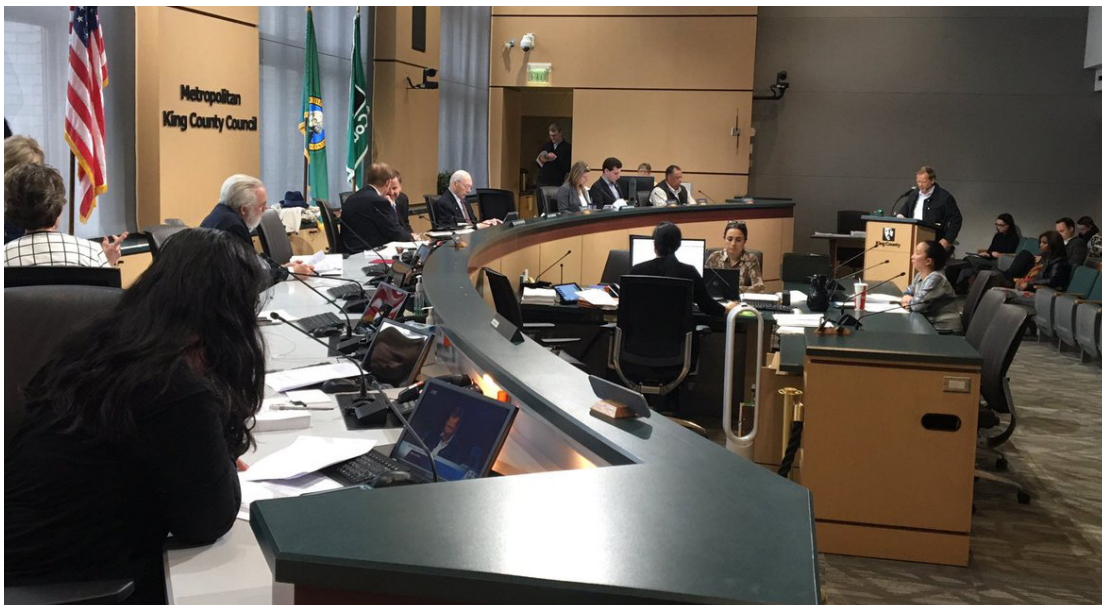
Regional Policy Committee Members

On December 18th , King County Executive Dow Constantine and Seattle Mayor Jenny Durkan signed the Interlocal Agreement approved by the Regional Policy Committee on December 5th, the Metropolitan King County Council on December 11th, and the Seattle City Council on December 16th.