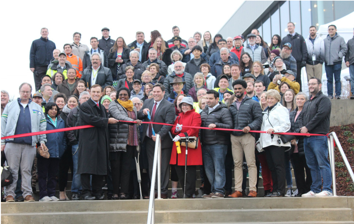
With Federal Way elected leaders and community members.

On December 4th , I was honored to be a part of Federal Way’s Downtown Staircase ribbon cutting. The staircase is an innovation in urban design for our city, and will be a key catalyst for the future of our downtown core.