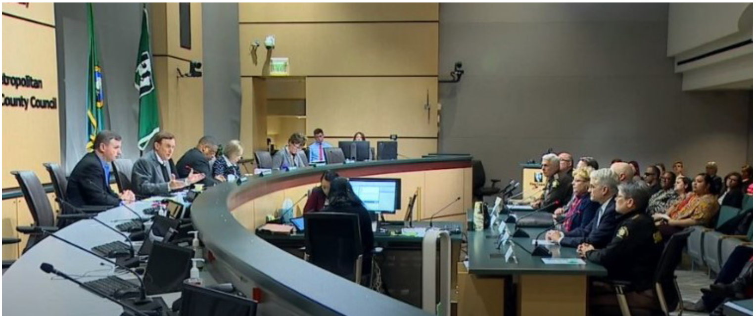
Government Accountability and Oversight Committee members and the invited panel.