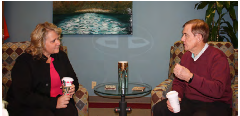
With Kent Mayor Dana Ralph at the Kent City Hall

I met with Kent Mayor Dana Ralph to discuss the rising crime rate in South King County and the concern it is causing our local communities. We cannot focus on public safety city by city; there must be a regional approach.