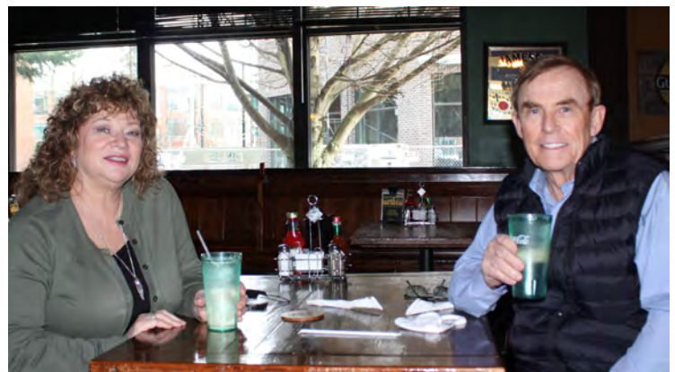
With Auburn Mayor Nancy Backus

I also had an opportunity to have lunch with Auburn Mayor Nancy Backus across from the Auburn City Hall. We caught up on criminal justice issues and reviewed proposals that are before the Sound Transit board, where we both serve as board members and where Nancy serves as the chair of the Finance and Audit Committee.