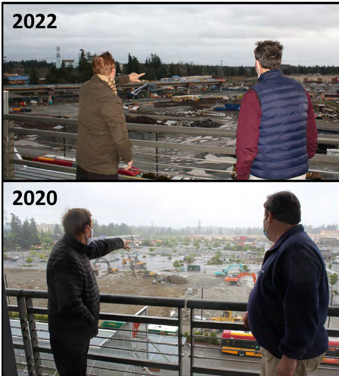
With Federal Way Mayor Jim Ferrell atop the Federal Way Transit Center parking garage, overlooking the future site of the Federal Way light rail station

We are beginning to see progress at the future site of the Federal Way Link light rail station. Two years ago, I visited this site with Mayor Jim Ferrell of Federal Way. I recently visited the site again to see how the project is going. Columns and girders are now in place to support the elevated tracks and station platform. We are excited to see what this project will offer not only to our transit riders, but also to the Federal Way Downtown core and the rest of South King County.