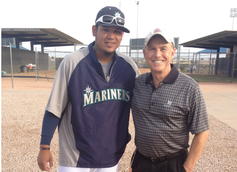
(Top) With Ken Griffey Jr. at an earlier Opening Day; (Bottom) With "The King" Félix Hernández at an earlier Spring Training