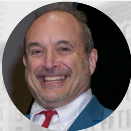
WITH AL DAMS

Join the discussion and Q&A about available property tax relief & deferral programs for eligible senior citizens, persons with disabilities, and disabled veterans