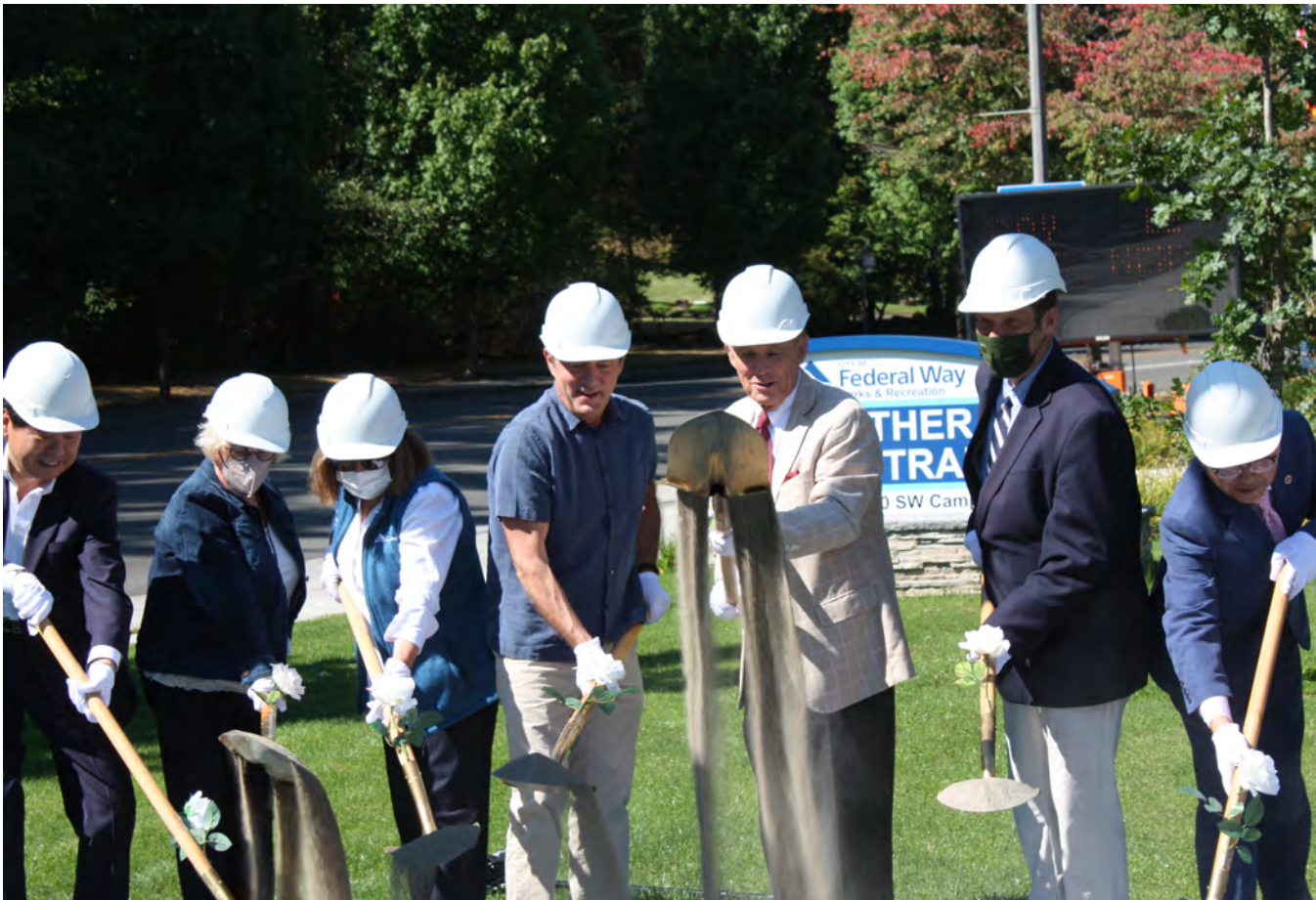
Breaking ground at the future site of the Hanwoori Garden in Federal Way

I had the pleasure of taking part in a groundbreaking ceremony held by the Federal Way Korean Association at the site of the future Hanwoori Garden. The City of Federal Way donated land at the entrance of the Panther Lake Trail for the garden to be built. The Hanwoori Garden will be the first traditional Korean garden of its kind in the Pacific Northwest and will be built with a mix of traditional and modern designs to celebrate the rich Korean heritage in our community. The project is expected to be completed by 2023-2024.