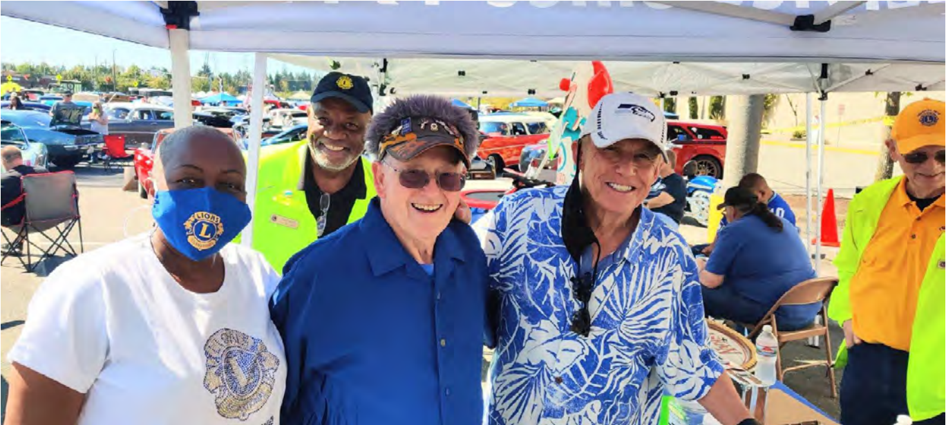
With members of the Federal Way Lions Club

Whether it's fighting diabetes or hunger, the Federal Way Lions Club raises money to help neighbors in need through various programs in our community. I had the pleasure of attending the 16th Annual Lions Club Scholarship Car Show at The Commons. The club's largest fundraising event of the year raises money for scholarships for Federal Way students. Great weather, great turnout, great cause!