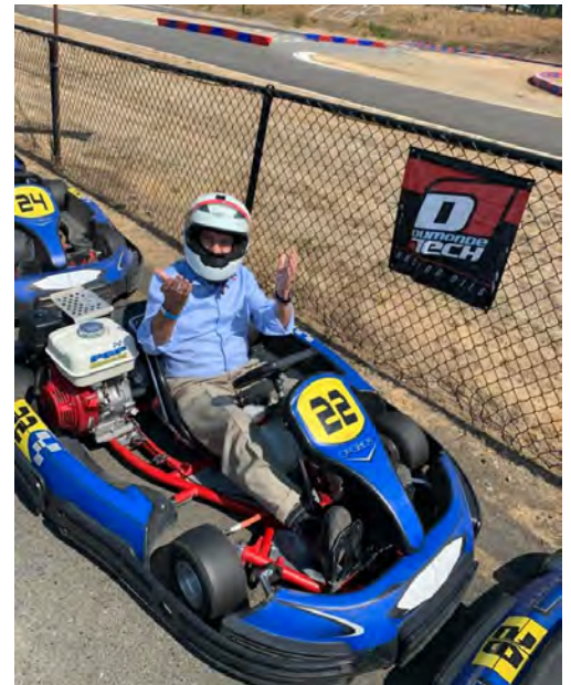
Wouldn't be a day at Pacific Raceways without a few laps around the go-kart track!