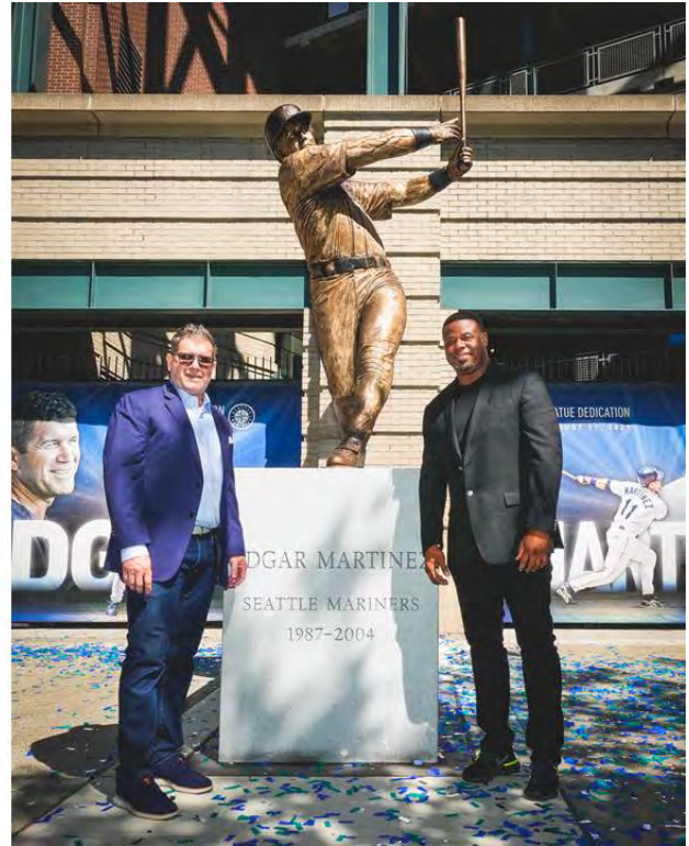
Left photo: With Edgar Martinez. Right photo: Edgar Martinez and Ken Griffey Jr.