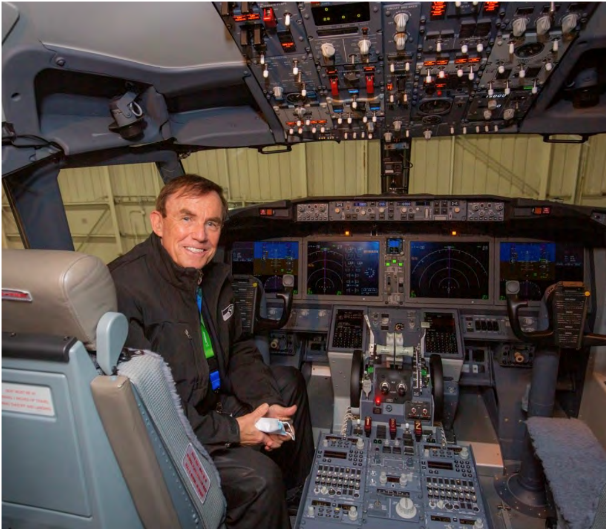
Checking out the cockpit of a new Boeing 737 MAX 9

If it's not Boeing, I'm not going! As a South King County resident, I was pleased to tour the new Boeing 737 MAX 9, which is designed to reduce the noise footprint of the aircraft through changes to the engine nacelles. I am proud to support an important local company that provides so much to our region through their work in the community and the thousands of jobs provided to our local economy.