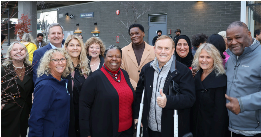
At the Federal Way Link Extension Preview on December 3rd, featuring the route from Kent Des Moines Station to Federal Way Downtown Station