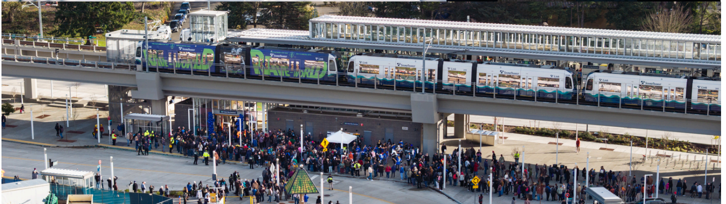
At the Federal Way Downtown Link Light Rail Station's Opening Day on December 6th