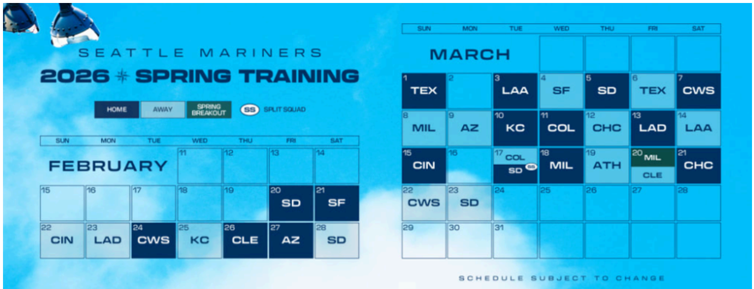
Seattle Mariners 2026 Spring Training Schedule